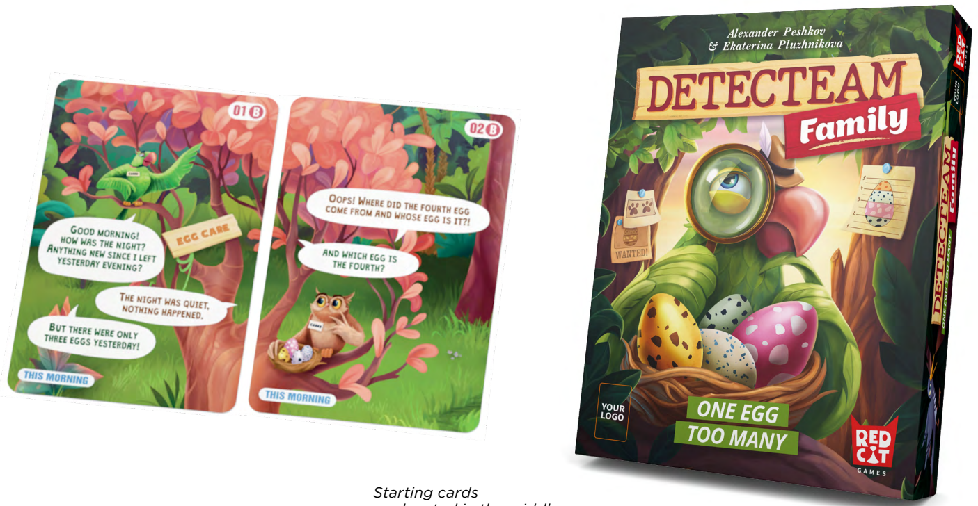
Starting cards are located in the middle of the picture.